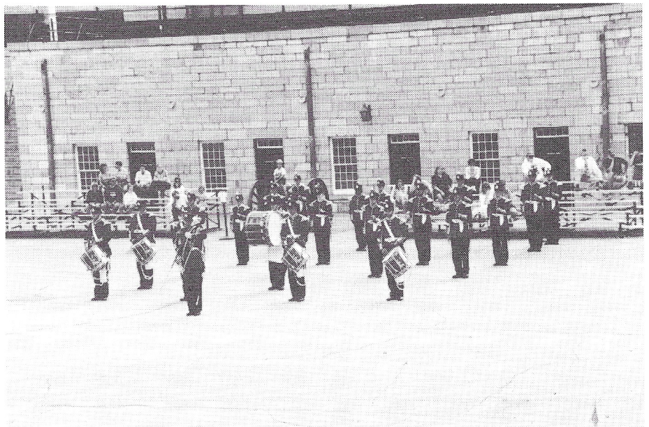
...the drums too ? Who's to give the gift of music...